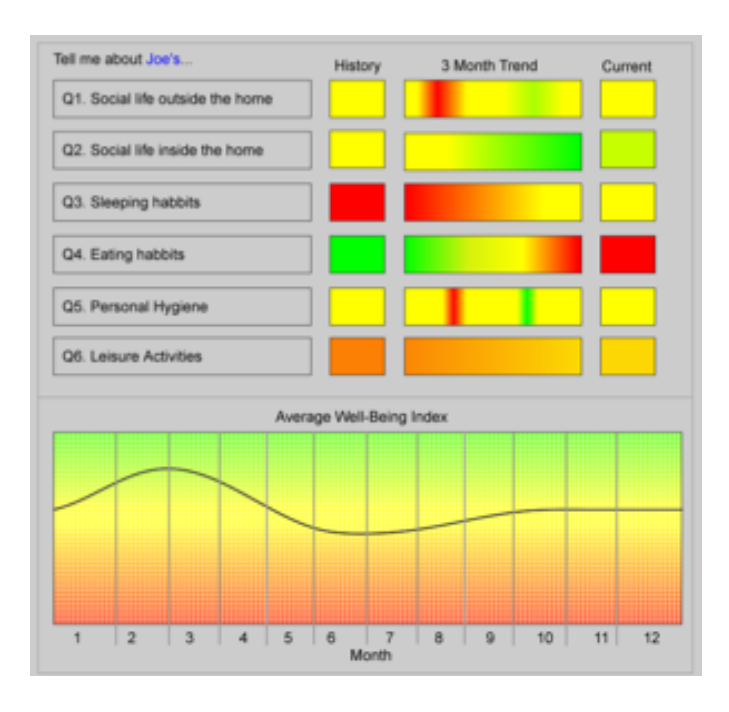
Figure 2. Example of graphical output for well-being monitoring System

The aim of the system is to highlight significant changes in general well-being by displaying the data collected from the sensors on a some kind of simple graphical output showing activity patterns over time. A possible example of this is given in Figure 2., showing changes over time for the six activities, as well as an overall well-being index. This aspect of the system is likely to be crucial and it is important that any information generated is "usable" within the care planning process; ie. the information should be a useful basis for assessing The development of the system client needs. interface will require close liaison with potential users in order optimise presentation and ensure that the information content is appropriate.